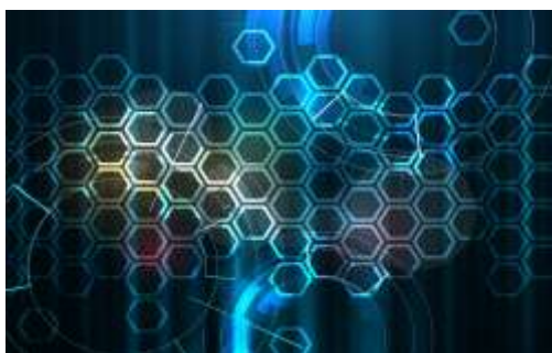
Figure 1: Insert caption to place caption below figure (Arial 10)